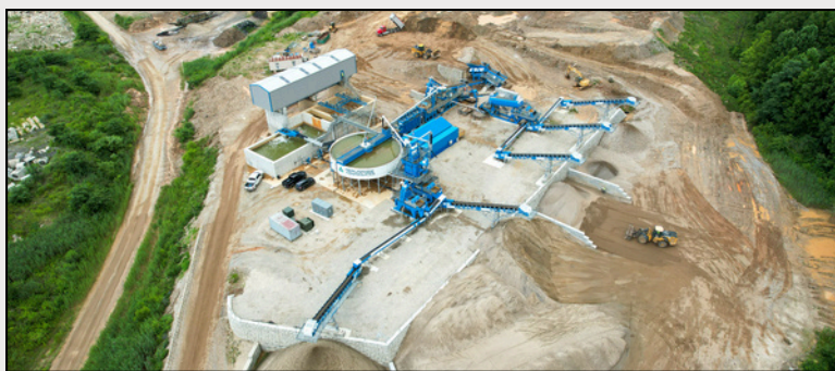
Repurpose Aggregates, MD

Our beton blocks are created exclusively with material from Repurpose Aggregates.